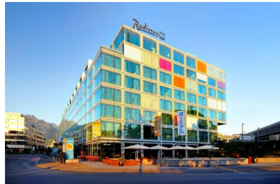
Radisson Blu Hotel Inseliquai 12, 6005 Luzern