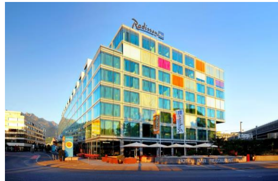
Radisson Blu Hotel Inselquai 12, 6005 Luzern