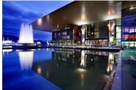
Radisson Blu Hotel Inselquai 12, 6005 Luzern